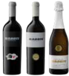
MASSIV® Red MASSIV® White MASSIV® White Sparkling

Our flagship wines can be found in the premium wine line of the top cuvées MASSIV® Red and MASSIV® White and are made from the best grapes. The unique cuvées embody their origin and our craftsmanship. MASSIV® Red is made from Blaufränkisch, Rathay, Zweigelt, Merlot and Cabernet. The best grapes including skin and seeds lie on the mash for a very long maceration period. Afterwards the wine is aged in barrique barrels. The white variant MASSIV® White is a blend of 90% Chardonnay with 10% mash-fermented Traminer. A particularly fine claim for wine connoisseurs and anyone who wants to become one.