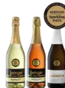
Sparkling DAYS Rosé Sparkling DAYS Muskat Ottonel MASSIV® White Sparkling

Sparkling DAYS Muskat Ottonel and Sparkling DAYS Rosé are made from sun-kissed grapes and are suitable for any occasion and provide particularly sparkling moments of pleasure. For very special sparkling moments and the fine standard, we have recently added our premium sparkling wine MASSIV® White Sparkling to our range.