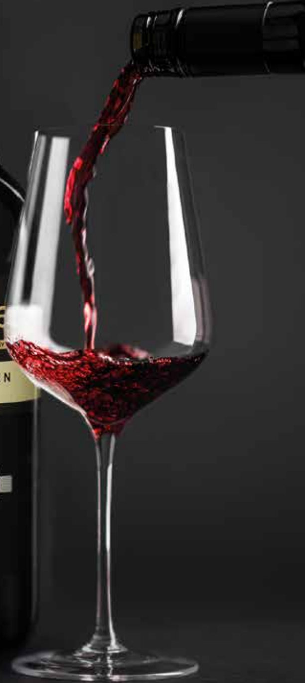
HEIDEBODEN Rotweincuvée 2020