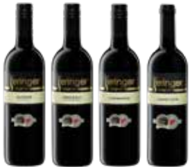
AVIATOR Blaufränkisch ZWEIGELT vom Heideboden COMMANDER St. Laurent GRANDE CUVÉE

We capture the power of the sun of an entire summer. Blaufränkisch, St. Laurent and Zweigelt are deeply rooted in the Neusiedlersee DAC wine-growing region and can look back on a long history here. The rare and very resistant Rathay comes from an Austrian breed with Blaufränkisch and is also considered autochthonous. The grape varieties have adapted optimally to the local conditions, produce the best qualities and reflect the terroir unmistakably. Our autochthonous red wine varieties are matured as a pure variety or as a cuvée in barriques in a harmonious mixture of stainless steel tank storage and first and multiple barrel occupancy. The result is accessible wines with soft tannins and exceptional intensity.