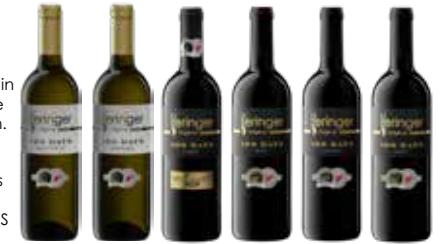
100DAYS Grüner Veltliner, 100 DAYS Chardonnay, 100 DAYS Zweigelt Neusiedlersee DAC Reserve, 100 DAYS Shiraz, 100 DAYS Cabernet, 100 DAYS Merlot

Our 100 DAYS wines are our pure premium wines. Individual development and taste are our priority in the wine cellar. These five wines are typical for the region and exceptional in their type of vinification. The grapes are processed as a single variety. The best grapes including skin and seeds lie on the mash for a period of at least 100 DAYS. Afterwards the wine is aged in barrique barrels to perfection. The Chardonnay is expanded for at least 100 DAYS on the fine lees in barrique barrels.