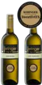
sweet Muskat LATE HARVEST Spätlese Cuvée

Pressing sweet wines from noble rotten grapes is one of the special features that the microclimate around Lake Neusiedl allows. It needs warm, humid autumn weather, which results in the subsequent development of botrytis. And it needs the skills of the winemaker, who makes the right decision at the right moment. This is how sweet wines are created that are able to express the flavor profile of our wine region particularly well. Our sweet wines are the perfect choice as an aperitif, with cheese or Asian dishes.