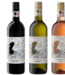
HEIDEBODEN Chardonnay HEIDEBODEN Rosé HEIDEBODEN Rotweincuvée

The sun-drenched Heideboden vineyard with its red gravel soils stretches east of Lake Neusiedl. It allows a drainage effect even in wetter years due to the permeable soil and it is particularly suitable for viticulture - a circumstance that has been used by winegrowers in the region for many years. The Heideboden area lends its name to our HEIDEBODEN trilogy. Robert Keringer himself played a leading role and was creative in designing the unique labels. An old historical map showing the Heideboden area, Lake Neusiedl and the location of the winery in Mönchhof served as a template for the memorable labels.